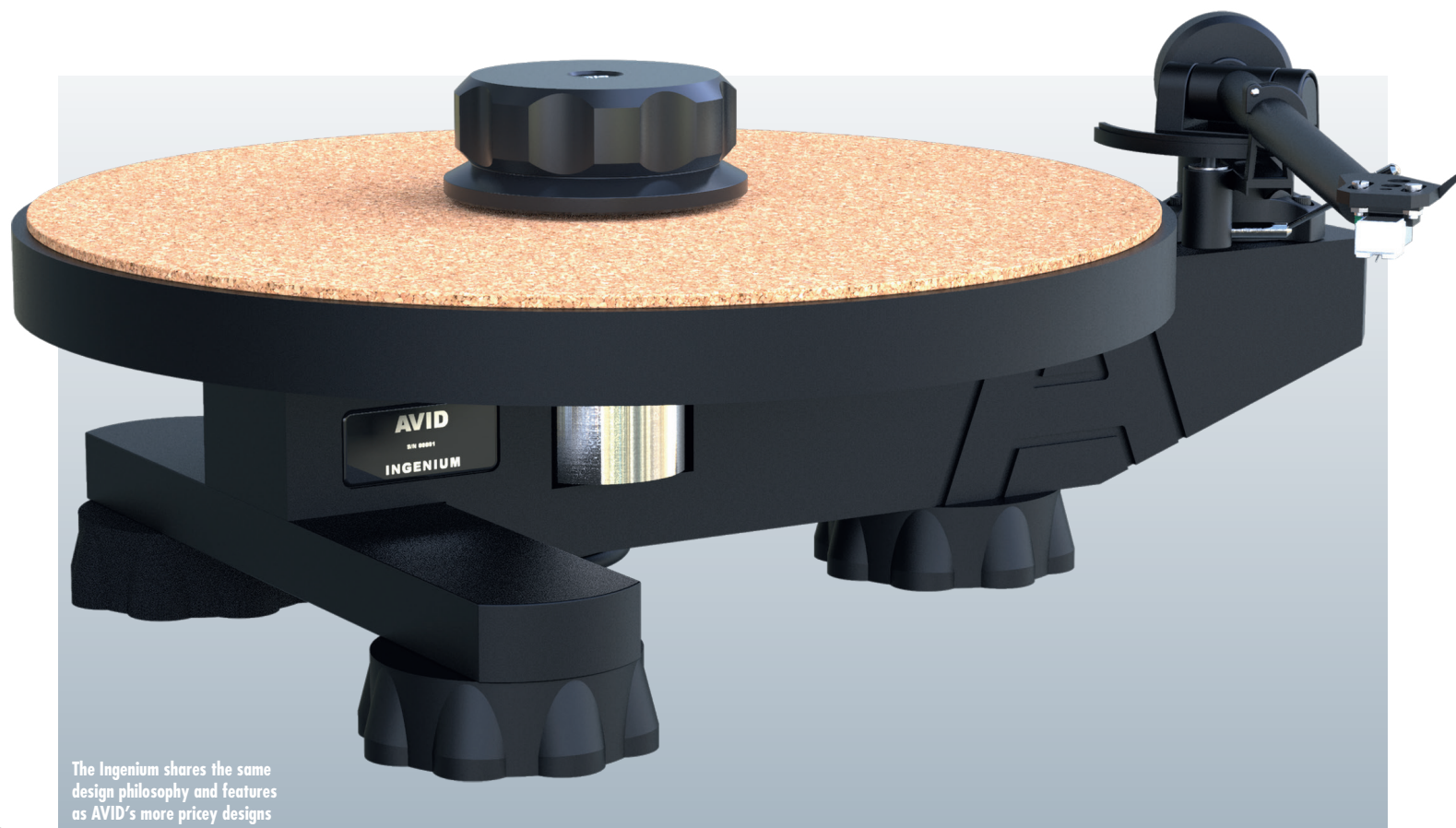
The Ingenium shares the same design philosophy and features as AVID's more pricey designs