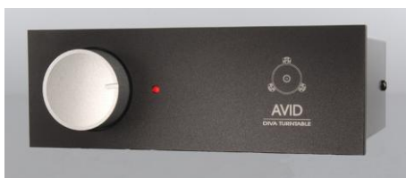
DIVA II PSU FRONT

The mains cable provided or a suitable alternative should be fused at no more than 5 AMPS.