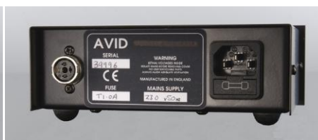
DIVA II PSU REAR